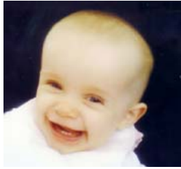
'Our brave Princess.'

Happy 1st Birthday. Love you loads and loads. From Mammy and Daddy.